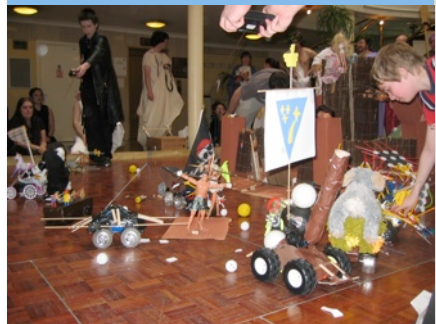
Contestants in the arena