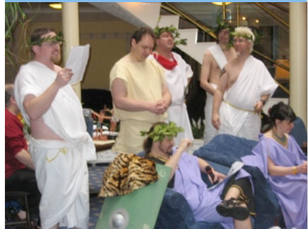
The Cyberdrome Circus Maximus crew preparing to start