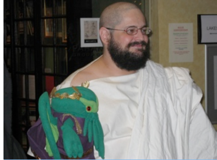
Multiple Hugo-nominated author and former <plokta.com> GoH Charles Stross