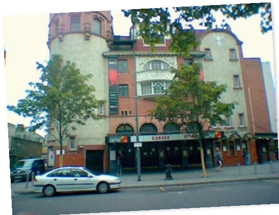
The Shepherd's Bush Empire

Well, if you're going to have a mid-life crisis, a gig ticket is a whole lot cheaper than a sports car. I bought a ticket, I found a website full of Kansas fans who call themselves Wheatheads, I caught up on 25 years of musical differences, and I became unduly excited about the concert.