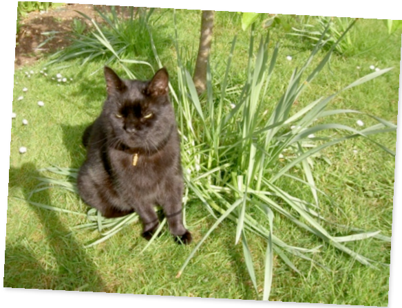
Shadow demonstrates his gardening technique (See p. 4)

Another IKEA... remember when IKEA had a moose with a Swedish flag cape as a mascot? Did I ever tell you I can see an IKEA from my balcony? Yes,