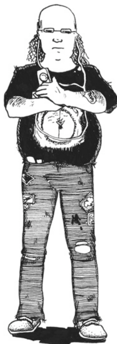
Kansas fan circa 2005