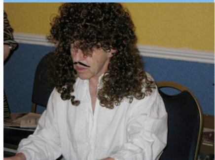
Famous SF author Charles Ian Watson