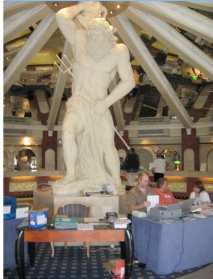
The inevitable shot of Neptune