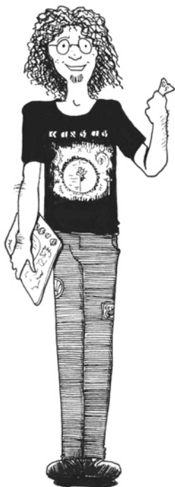
Kansas fan circa 1979

wanted it. So I went in search of it, and found Kansas's website, http://www.kansasband.com , and discovered it was modelled on the theatre theme from Two For the Show .